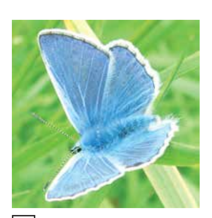
Common blue butterfly