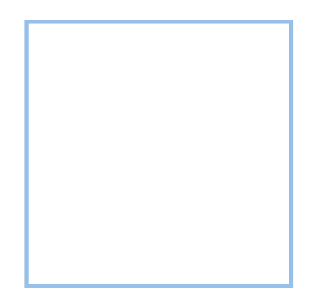
What else did you spot?