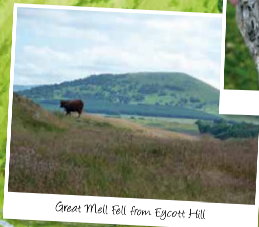
Great Mell Fell from Eycott Hill