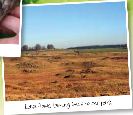
Lava flows, looking back to car park