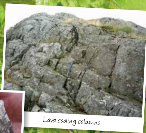
Lava cooling columns