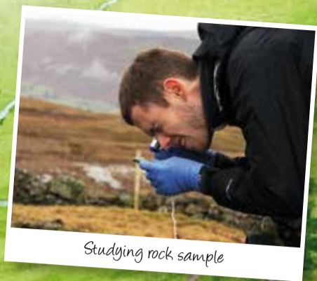
Studying rock sample