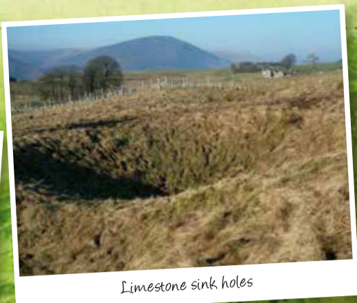
Limestone sink holes