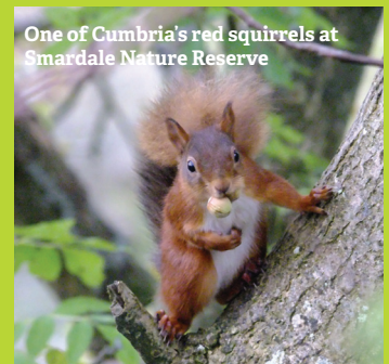
One of Cumbria's red squirrels at Smardale Nature Reserve

Cumbria is on the frontline of red squirrel conservation with three red squirrel reserves at Greystoke, Whinfell and Kielder falling within the Penrith and the Borders constituency.