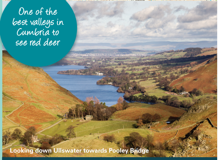
Looking down Ullswater towards Pooley Bridge

One of the best valleys in Cumbria to see red deer