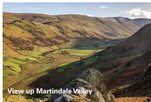
View up Martindale Valley

There's one wonderful piece of interesting history associated with the valley. At the start of the walk, as you