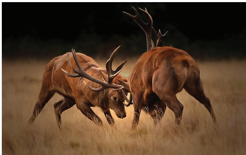
Early mornings and dusk are the best times to see red deer