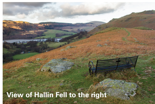
View of Hallin Fell to the right