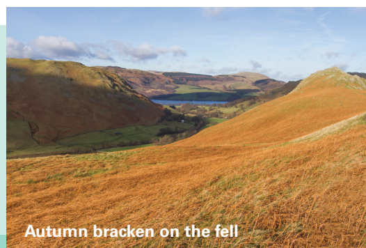
Autumn bracken on the fell

make your way towards the head of the valley, look to your left and in the distance you'll spot a distinctive red roofed lodge. This was the home of the Earl of Lonsdale whose favourite colour (despite the roof of the lodge suggesting otherwise) was yellow – it appeared on all his carriages and throughout his house. The Earl went on to become the first president of the AA and when they were looking for colours for their livery, naturally he suggested yellow, the colour they still use to this day.